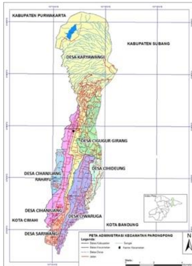
Figure 1 Research Location

This research was conducted in Parongpong District, West Bandung Regency, from May to October 2024. The research location is shown in Figure 1.