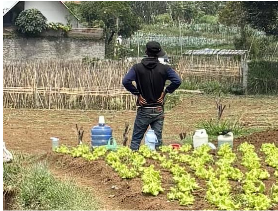
Figure 2. Food and Beverages Present During Pesticide Application.

agricultural regions, where inadequate waste management increase the risk of soil and water contamination (Rani et al., 2021). This finding reinforces the need for structured pesticide waste management program at the local level.