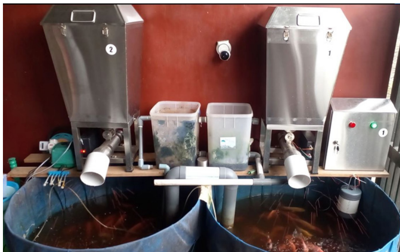
Figure 3. Example of application of automatic fish feeding technology.