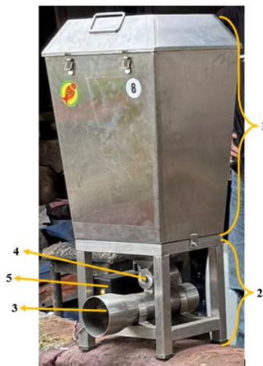
Figure 1. An automatic fish feeder that is combined with an accurate feed dispensing system and digitally timed program.

The first step in data acquisition is the measurement of the initial total weight of the fish at stocking. Feeding is done by automatic fish-feeding technology, while water quality is measured daily. After 1.5 months, several parameters, such as fish weight, specific growth rate, survival rate, and feed efficiency, are measured.