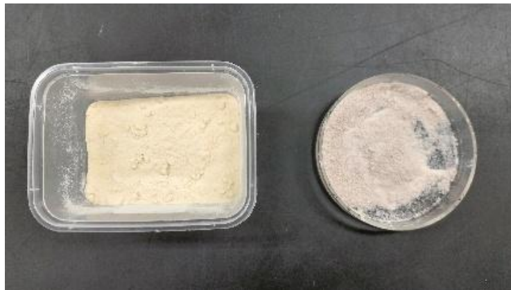
Figure 3. Final powdered products: research kombucha powder (left) and commercial kombucha powder (right).

from this study more visually appealing and preferred by the panelists, with an average color preference score of 6.13 on a 7-point scale.