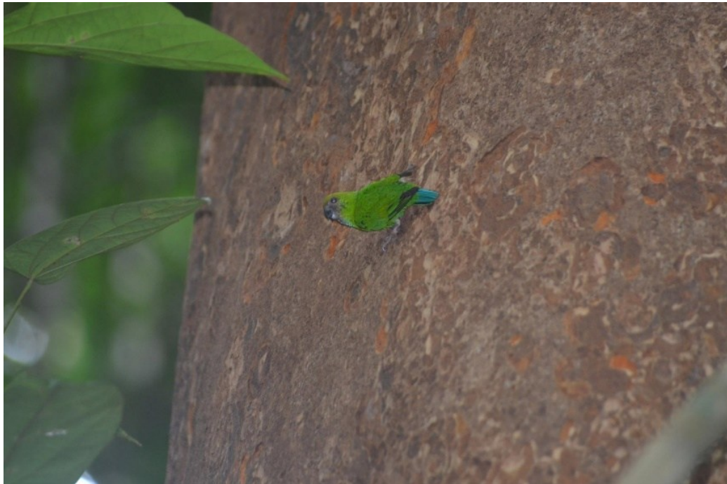
Figure 2. The Yellow-capped Pygmy Parrot ( Micropsitta keiensis ), a lichenivorous species, was observed foraging on the trunk of Pometia coriacea by gleaning moss in a lowland tropical forest.

can be attributed to the absence of vegetation at this stage of tree growth, as lichenivore guilds usually feed on moss on tree trunks and branches. The presence of this type in the intermediate and late stages of succession shows that vegetation is growing trees that provide a source of moss food for this species. During the study these species foraging on the trunk of the Pometia coriacea tree (Figure 2).