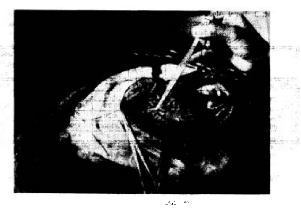
Fig. 2. Position of the Right Ruminal Vein where the Infusion Cannula is Placed for Portal Blood Flow Measurement by the PAH-Method