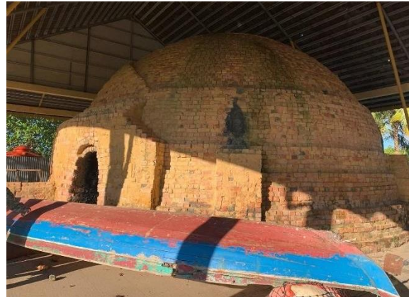
Figure 6. The condition of the Berakit Charcoal Kitchen is no longer in use

Orang Suku Laut communities have great potential as a regional asset as their local wisdom and unique way of life attract tourists and researchers, both local and foreign. If properly developed by the local government, this can be a lucrative attraction for the community and the region itself. Currently, many tourists are interested in visiting Berakit to mingle with the Orang Suku Laut communities and understand their lives. However, this potential has not been maximized and further action is needed to optimize it.