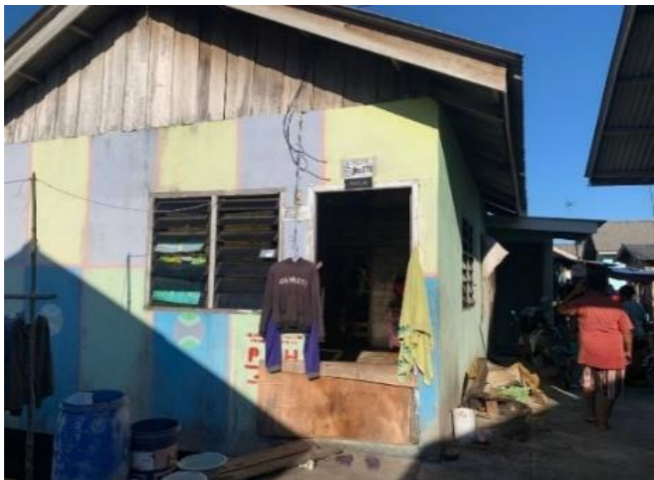
Figure 7. Harun's House Condition