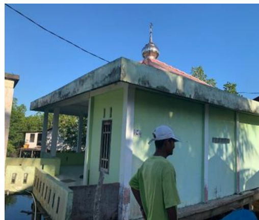
Figure 9. Church Bone Fasius

Currently, Orang Suku Laut have a high religious diversity consisting of Islam and Catholicism. This freedom of religious choice is strongly influenced by religious assistance programs located around their place of residence (Elsera, Rahmawati, et al., 2022). While there is freedom of religious choice, the presence of migrants, including religious leaders, puts pressure on local communities to adopt certain religious practices. A high sense of tolerance is evident in the coexistence of mosques and churches; however, this blurring of identities means that in order to obtain government assistance, administrative documents such as family cards and ID cards must list a religion, so communities must follow religious norms that may not fully align with long-established local beliefs.