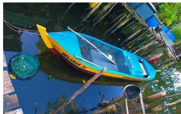
Figure 3. GT Fiber Wood Ship

Regional spatial plans for communities whose homes are wholly or partly in the sea, such as the Berakit Orang Suku Laut, will have a submission letter so that there will be an automatic endorsement indicating