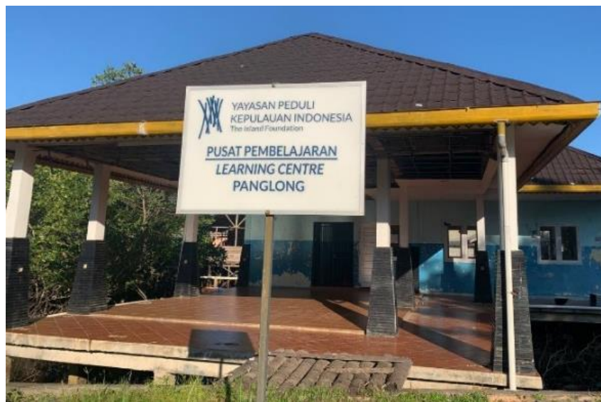
Figure 10. Panglong Learning Center by Yayasan Peduli Kepulauan Indonesia

In addition, even though they are a community that used to live at sea and lack education, after they live on land with the collaboration between the foundation and the head of the Orang Suku Laut who is proficient in English and routinely learns English, many of the Orang Suku Laut are proficient in English, because their place is often visited by foreign tourists.