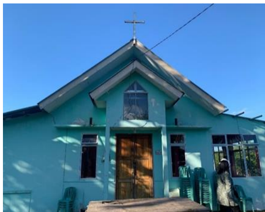
Figure 8. Musholla Nurul Iman