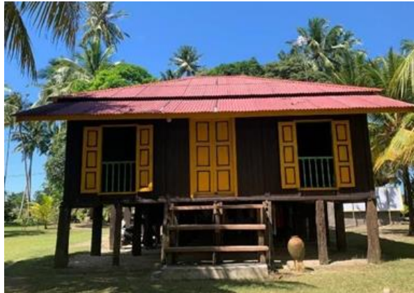
Figure 5. Rumah Melayu After Building Maintenance by the Government

their identity is undergoing significant transformation due to changing lifestyles and reduced mobility. While government policies like the Marine Spatial Plan and tourism development in Berakit present opportunities, they also threaten traditional rights. Furthermore, their involvement in cultural preservation and recognition as part of the local coastal community allows them to redefine their identity, albeit within a complex context that risks eroding traditional values.