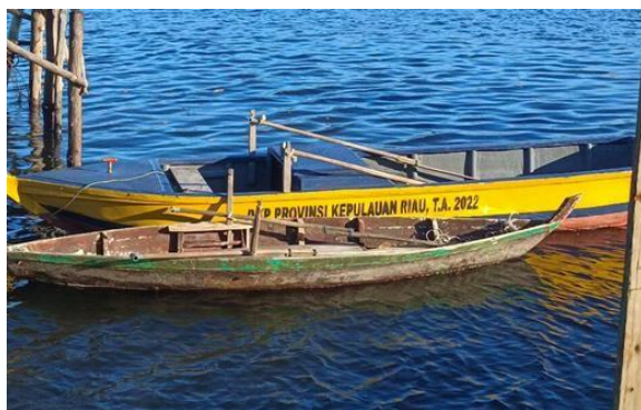
Figure 2. GT Fiber Motorboat

Utilizing the potential in the sea space, of course, has its own way and different tools than on land, so better technology and tools are needed as an important role holder (Priyanta, 2021). Therefore, the assistance of the Marine Fisheries Service at both the provincial and district/city levels is needed. At least fishermen who are often assisted are given a fish finder (fish tracking device) so that they save fuel to see the fish ground (catchment area). Only small fishermen are eligible to be assisted with fuel subsidies. According to Law No. 45/2009 on Fisheries, a small fisherman is a person whose livelihood is fishing to meet the needs of daily life using a fishing vessel with a maximum size of 5 (five) gross tons (GT)."