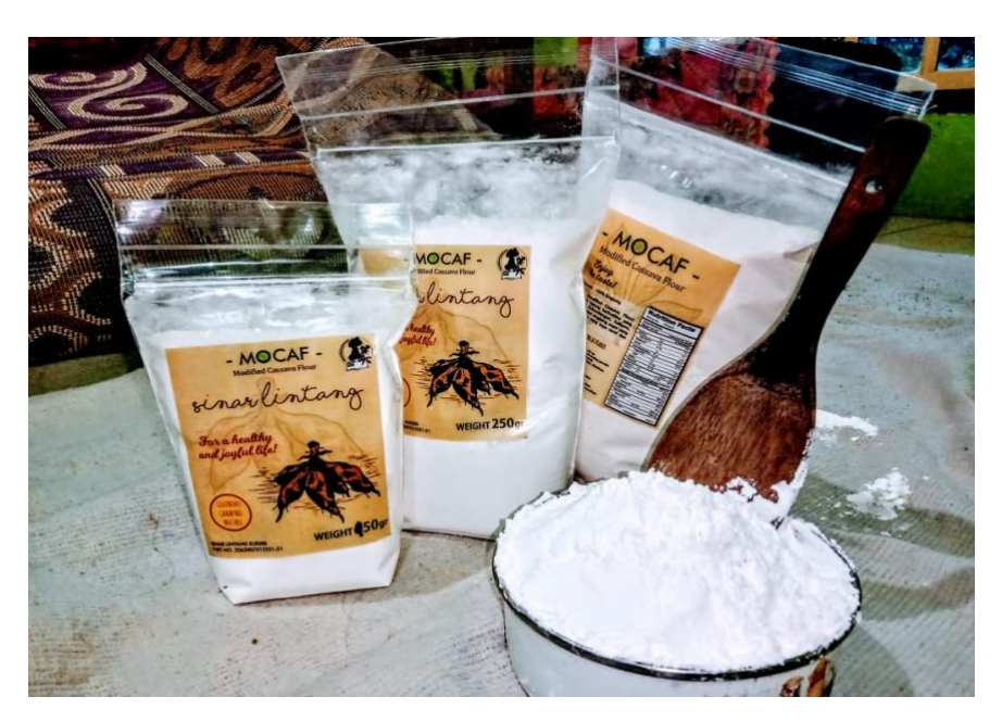
Figure 1. Mocaf Flour Products of Kelompok Perempuan Singkong Jaya in Sukowilangun Village, East Java

In the children empowerment program, an art group, namely Lembaga Pelatihan (training institution) Setia Budhaya has conducted art training for children. This institution provides art training twice a week, including traditional music (gamelan) and dance for the children in Sukowilangun village, and this training is held in a studio. From the observation, it could be seen that the children were very enthusiastic to join the training. Other children were playing with their friends without using a gadget while watching the training or waiting for their turn.