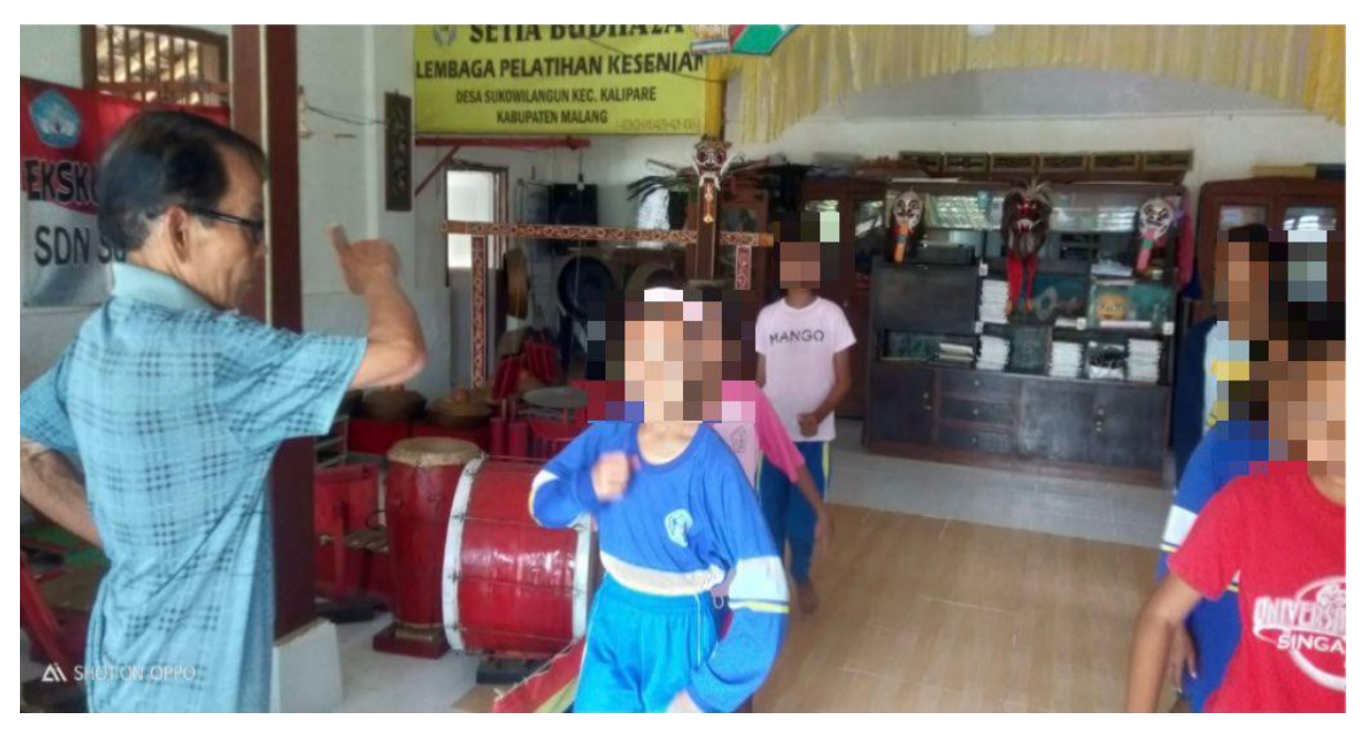
Figure 2. The Studio of Lembaga Pelatihan Kesenian Setia Budhaya in Sukowilangun Village, East Java

This study has found another indicator of friendly infrastructure for children and women in Sukowilangun village. Most of this infrastructure is provided by the local government, including playgrounds, facilities at kindergartens, a library accessible to parents and their children in the village hall, and a football field where the children can play sports activities. Moreover, community members in Sukowilangun Village also provide other friendly infrastructure for women and children, such as a studio for traditional music and dance belonging to Lembaga Pelatihan Kesenian Setia Budhaya (illustrated in Figure 2) and a production house provided by Kelompok Perempuan Singkong Jaya, where its members produce various kinds of cassava products.