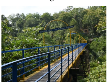
Figure 2. The Tourism Awareness Group manages Tourist Destinations.