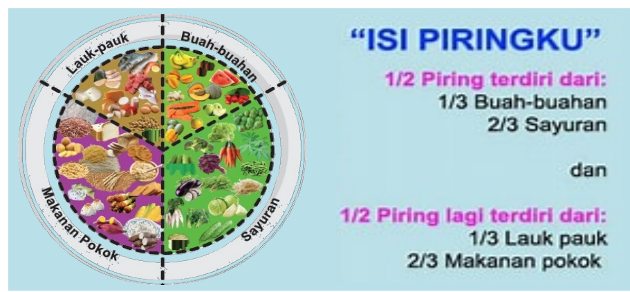
Figure 1. Balanced nutritional composition in the contents of my plate (Kemenkes Website, 2020)

which will be delivered to the community to discuss food and nutrition problems that occur in the working area of the Pidie District Health Office.