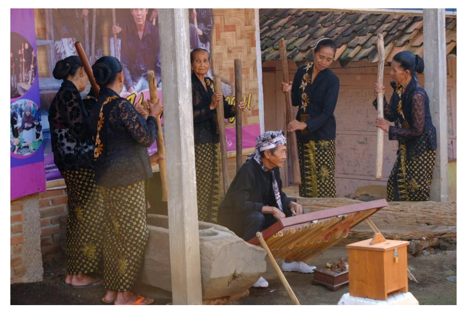
Figure 2. Otekan performance

The findings are consistent with those by Cole (2007), Kırlar Can et al., (2017) and Getz & Page (2016) who found that the presence of tourists urges cultural differences and modified authenticity. The consequences might be partly explained by intensive interaction between local and tourists and the economic motives while gaining maximum economic benefits. This idea supports the notion proposed by Bentham (2000) in his utilitarianism that argued the tendency of an action to increase overall happiness. The economic activities of the Osing people illustrate that the feelings of pride to introduce the culture and gain the economy prompt them to continually sell and produce in commoditized activities. The action and the choice to modify the festivals showed that the pleasure from both aspects constituted the metaphysical foundation, and the choice behavior reflected the level of the gained pleasure. As the community members gain socio-cultural gain such as pride and strengthened identity and economic benefits, they tend to continually do cultural commodification as suggested by Bentham (2000) that pleasure becomes the go signal that directs creatures to sustain important activities, and pain becomes the stop signal that obstructs activities that are causing harm.