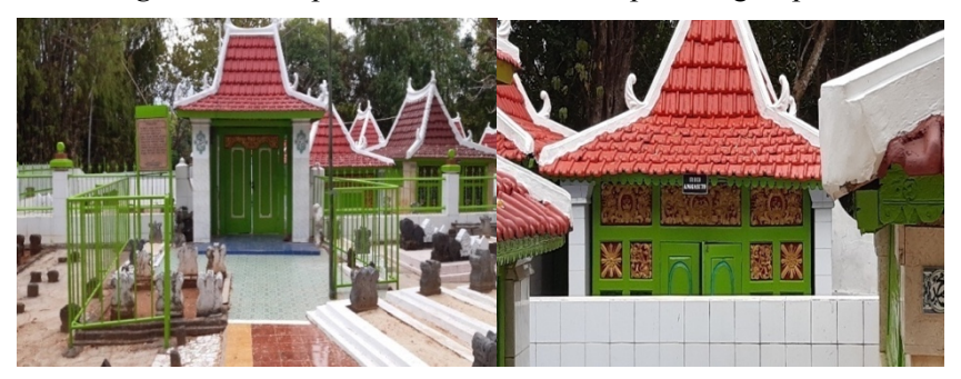
Figure 2 Buju' Ghubâng Cemetery

The Madurese community prepares all equipment (Suhelmi, et al, 2013) by providing chicken or milkfish as rasol nyadar as part of the offerings, but not all chicken meat has yet to be included in nyadar ritual, because sometimes it contains dog meat, pork and throat meat.<sup>3</sup> After Friday prayer the people of salt farmers community began gathering to Buju 'Ghubhang cemetery in figure 2, which consists of the graves of Sheikh Raden Anggasuto, Emba Kabasa (Kuasa), Emba Bangsa, and Emba Dukun (youngest ancestor). Arriving at the burial site of Buju 'Ghubhang (in figure 2), the Madurese community give a sontengan <sup>4</sup> to the representatives of their respective groups.<sup>5</sup>