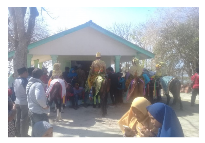
Figure 1: The blessing of buju ' Saleman

In addition, the respect of the salt farming community towards the spirits of their ancestors through the tradition of necromance or through the medium of tahlilan , which is carried out in a communal slameten manner. This cultural practice takes place for seven days, the participants do not get special invitation, because this salvation is better understood as a communal party that is open in nature, so that it involves citizens of all ages and all men. The offerings provided in the salvation that are served to the residents of the tahlilan participants at telok arena (day 3), and pettok arena (day 7), seem to be more privileged than the other days. The leaders of this tahlilan are usually a Kiai or community leader. Besides pettok arena , other times that are considered special to honor the spirits of the ancestors are the pakpoloh arena (the 40<sup>th</sup> day), satos arena (the 100<sup>th</sup> day), nataon (one year the day of his death), and nyaebuna (the 1000<sup>th</sup> day) (Rifa'i, 2007). Even so, there are some members of the community who respect the spirits of their ancestors, namely every year the death of his family or often called a haul. However, those who carry out the tradition are only those who are economically capable, and are regarded as community leaders (politics) or Kiai families (Pribadi, 2018).