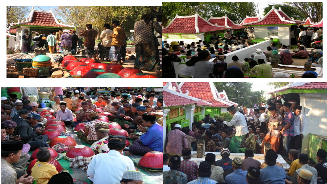
Figure 4 Nyadar Religious Cultural Rituals