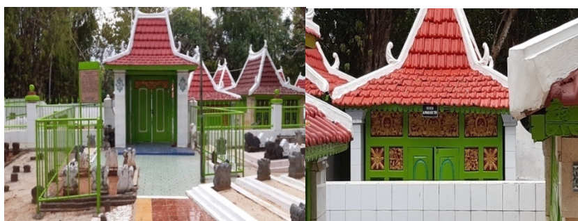
Figure 2 Buju 'Ghubang Cemetery

The Madurese community prepares all equipment (Suhelmi, et al, 2013) by providing chicken or milkfish as rasol nyadar as part of the offerings, but not all chicken meat has yet to be included in nyadar ritual, because sometimes it contains dog meat, pork and throat meat. 3 After Friday prayer the people of salt farmers community began gathering to Buju 'Ghubhang cemetery in figure 2, which consists of the graves of Sheikh Raden Anggasuto, Emba Kabasa (Kuasa), Emba Bangsa, and Emba Dukun (youngest ancestor). Arriving at the burial site of Buju 'Ghubhang (in figure 2), the Madurese community give a sontengan 4 to the representatives of their respective groups. 5