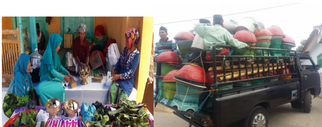
Figure 3 Preparations for Nyadar Ceremony: The Collection of Flowers and Offerings; Carrying Nyadar Ritual Provisions towards the Location of Ritual Tradition

Before sowing flower ceremony, an important cultural religious ritual in nyadar must be performed, which is scrambling to enter the cemetery of the ancestors to offer prayer, because for the Madurese community, entering the ancestral tomb will speed up the acceptance of the prayer. They struggle to seize the powder solution, by dipping the index finger into the powder solution to eat and the rest applied to some parts of the face as a sign to their ancestors that they participate in nyadar event. Then they offer prayers to the ancestors, because the ancestors are nicknamed Allah, guardians, and apostles. Because the ancestor's position is very high, whatever is requested will be granted by the ancestors (Hefni, 2019).