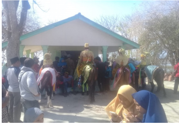
Figure 1: The blessing of buju' Saleman

In addition, the respect of the salt farming community towards the spirits of their ancestors through the tradition of necromance or through the medium of tahlilan , which is carried out in a communal slameten manner. This cultural practice takes place for seven days, the participants do not get special invitation, because this salvation is better understood as a communal party that is open in nature, so that it involves citizens of all ages and all men. The offerings provided in the salvation that are served to the residents of the tahlilan participants at telok arena (day 3), and pettok arena (day 7), seem to be more privileged than the other days. The leaders of this tahlilan are usually a Kiai or community leader. Besides pettok arena , other times that are considered special to honor the spirits of the ancestors are the pakpoloh arena (the 40 th day), satos arena (the 100 th day), nataon (one year the day of his death), and nyaebuna (the 1000 th day) (Rifa'i, 2007). Even so, there are some members of the community who respect the spirits of their ancestors, namely every year the death of his family or often called a haul. However, those who carry out the tradition are only those who are economically capable, and are regarded as community leaders (politics) or Kiai families (Pribadi, 2018).