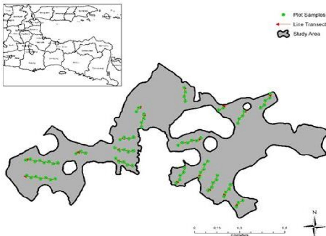
Figure 1. Research sampling points on Clungup Mangrove Conservation (CMC)