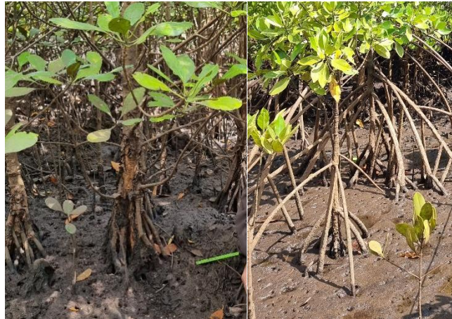
Figure 3. Research sampling points on Clungup Mangrove Conservation (CMC)

denser the root conditions, the higher the metal content trapped in the plant area. This can be seen in Figure 3, where the root conditions in Ceriops tagal are denser than those in Rhizophora apiculata , so it cannot be denied that the BCF of Ceriops tagal roots is higher.