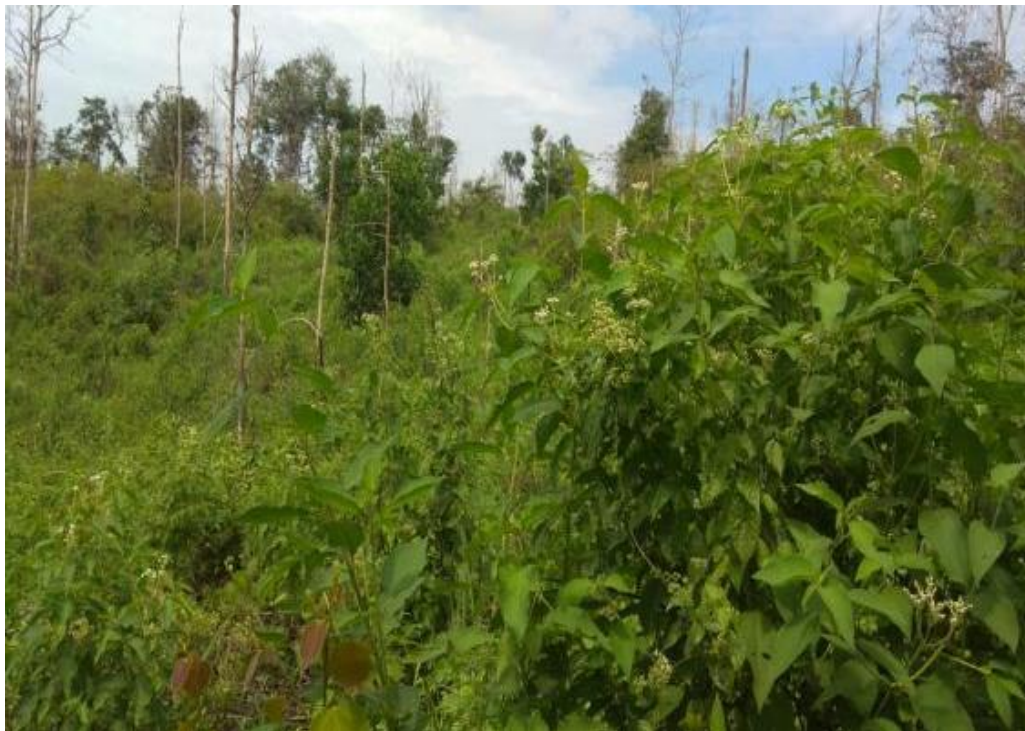
Figure 2. Conditions of Tahura STS landscape after 2019 forest fire

The diversity index uses the following formula (Indriyanto 2006) :