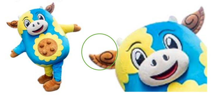
Figure 8. Coe Morry Mascot, mascot's ears designed in the shape of a curry puff. (Coemorry, 2018)