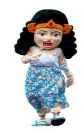
Figure 10. Ma-Ma-Mood Mascot in Rayong, wearing Hawaiian costume reflecting the islander's way of life.