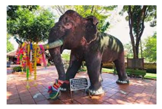
Figure 2. The prototype of the Green-Tusk Elephant Mascot at Wat Kai Kaeo, Lamphun.

Traditions and beliefs . Traditions and beliefs mean that the mascot is able to show a connection between the traditions and beliefs of the province. Traditions and beliefs are activities that have been practiced for a long time(Sharatchai, 2002)They focus on mascots bringing stories of traditions or ancient beliefs of the province to communicate including Nong Fan Mascot, Chang Pu Kham Nga Khiew Mascot, Croco Mascot, and Jor-bot Mascot.