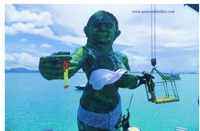
Figure 9. Phi SeuaSamut Statue at Koh Samet, a major tourist attraction of Rayong.