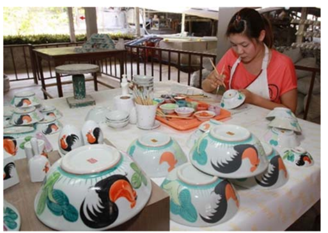
Figure 14. The chickenbrand bowl, the craftsmanship of Lampang. (Thawipakorn, 2018)