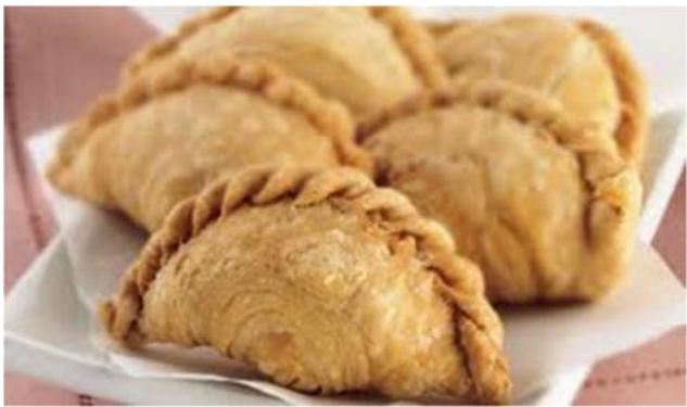
Figure 7. Curry puff, famous food of Saraburi. (Gotoknow, 2013)

Food and products. Food and products focus on mascots bringing food and products that are both local arts and handicrafts, and other local products to communicate as a selling point to attract tourists such as Nong Cham Mascot, MeeKaew Mascot, Khun Thong Boran Mascot, Ponglang and Phraewa Mascots, Coe Morry Mascot, Leng Mascot, Tong Tong Mascot, Noo Juab Mascot, and Nong Jung Mascot. Their messages are encrypted through the appearance of vegetablessuch as bamboo shoots that people like to eat, fruitsuch pineapples that are economiccrops, sea creatures, and handicraftsuch as scarves in the icon level. That is, there is something that looks like or resembles real objects and are easily understandable to recipients(Chatchawan, 2015). The sender binds mascots to famous food or merchandise that the recipients may have known or tried before. When the recipients see a mascot, it is easy to remember its origin. For instance, the Coe Morry Mascot of Saraburi uses the No. 1 food of the province, curry puff, which has ever since been a souvenir of travelers and tourists (see Figures 7 and 8). This explanation is supported from an interview with an informant: "Usually when tourists search Saraburi, they will always see information on one of the most famous products. That is curry puff. So we design the mascot's ears to look like curry puff. If you think of Saraburi, a local product that is Saraburi's identity is curry puff." (Sathienphan, C, Saraburi Province, 20/4/2020).