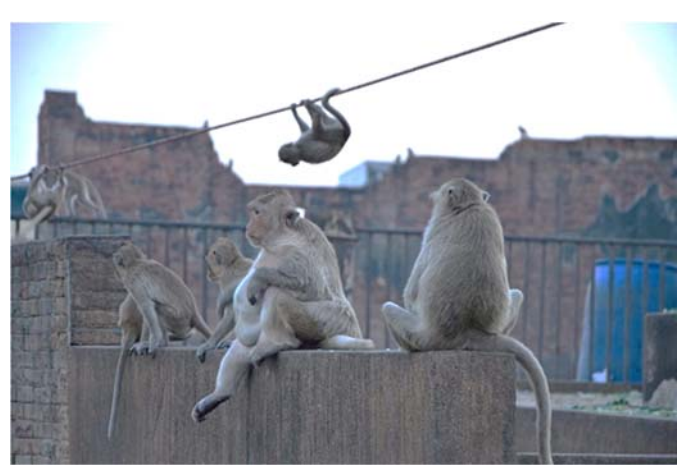
Figure 15. Jor-bot Mascot of Lopburi. (Thairath Online, 2018)