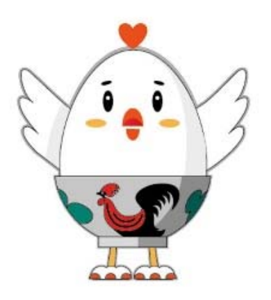
Figure 13, The Nong Chram Mascot uses the chicken brand bowl as a highlight in communicating provincial identity.(Endless Charm Lampang, 2019)