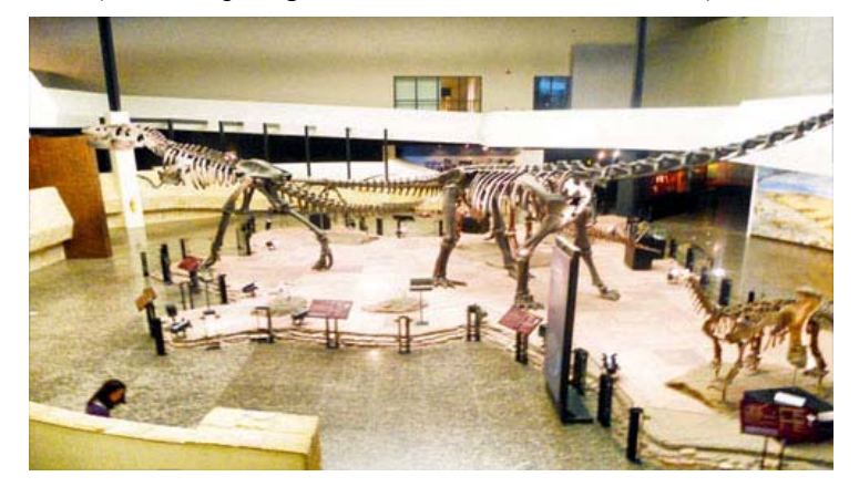
Figure 4. The skeleton of Phuwiangosaurussirindhornae, prototype of Dino Mascot. (Surfing around Thailand, 2018)