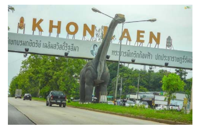
Figure 6. A dinosaur statue is used as symbol of Khonkaen.(Mgronline, 2020)

Food and products. Food and products focus on mascots bringing food and products that are both local arts and handicrafts, and other local products to communicate as a selling point to attract tourists such as Nong Cham Mascot, MeeKaew Mascot, Khun Thong Boran Mascot, Ponglang and Phraewa Mascots, Coe Morry Mascot, Leng Mascot, Tong Tong Mascot, Noo Juab Mascot, and Nong Jung Mascot. Their messages are encrypted through the appearance of vegetablessuch as bamboo shoots that people like to eat, fruitsuch pineapples that are economiccrops, sea creatures, and handicraftsuch as scarves in the icon level. That is, there is something that looks like or resembles real objects and are easily understandable to recipients(Chatchawan, 2015). The sender binds mascots to famous food or merchandise that the recipients may have known or tried before. When the recipients see a mascot, it is easy to remember its origin. For instance, the Coe Morry Mascot of Saraburi uses the No. 1 food of the province, curry puff, which has ever since been a souvenir of travelers and tourists (see Figures 7 and 8). This explanation is supported from an interview with an informant: "Usually when tourists search Saraburi, they will always see information on one of the most famous products. That is curry puff. So we design the mascot's ears to look like curry puff. If you think of Saraburi, a local product that is Saraburi's identity is curry puff." (Sathienphan, C, Saraburi Province, 20/4/2020).