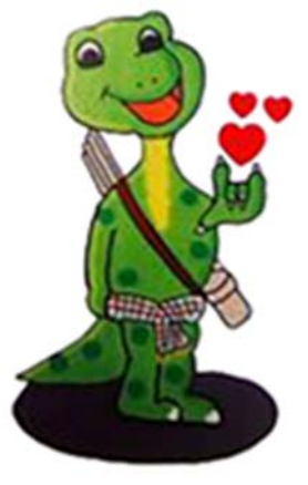
Figure 5. Dino Mascot (Dino Khon Kaen, 2019)