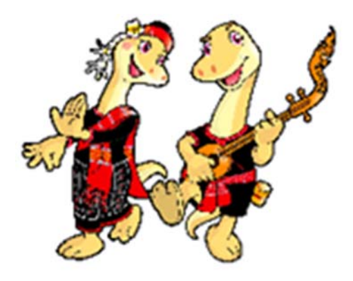
Figure 11. Ponglang and Phraewa Mascots wear a Phu Thai costume reflecting the identity of Kalasin people. (Faculty of Humanities, 2018)