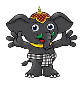
Figure 3. Chang Pu Kham Nga KhiewMascot. (Lamphun Province, 2017)