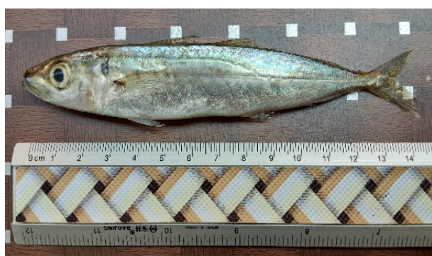
Figure 1. Round scad.

Round scad cathced by mini purse seine during the research, has a length of approximately 14 cm and weight 45-50 grams / head, shown in Figure 1.