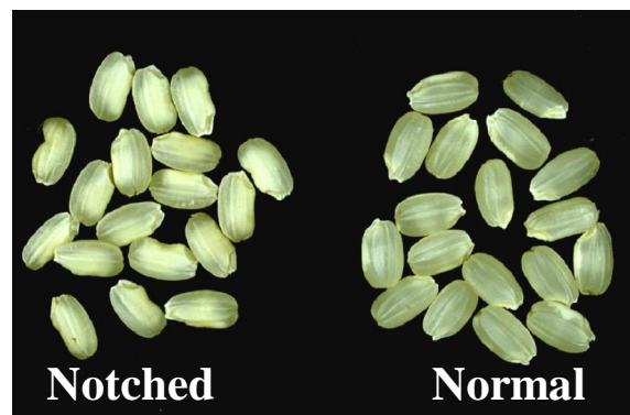
Figure 2. Phenotype of notched kernel (left) and normal kernel (right) segregated in BC 4 F 2 population.

they germinated starting from 21 days after pollination, and the germination rate reaches 70% at 28 days after pollination (Ishibasi et al. , 2005), while the normal seeds of Taichung 65 germinated only about 20% when they were treated by the same treatment. So, this notched kernel was highly associated with pre-harvest sprouting character.