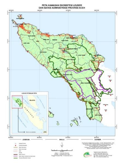
Fig 1. Map of the Leuser ecosystem area and administration border of Aceh

This research was done during July 2015 in the Ketambe research station, Aceh South-East District. The method applied was belt transect, on the purposive area, about 1 ha. The observation plot was measured 5 m x 50 m along the transect line. The total numbers of observation plots are 25 plots. The data was collected by observing the availability of Dipterocarpaceae species on the observation plot. The observation covered species and individual number of species. The location of the research area is showed from the map below (Fig. 1)