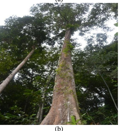
Fig. 3. Buttress tree: (a) Shorea leprosula, (b) Shorea johorensis tree