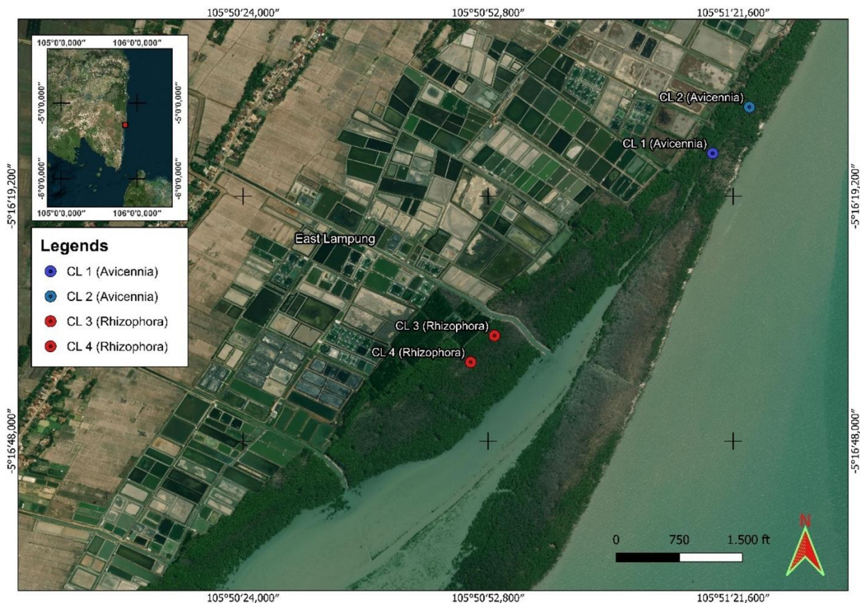
Figure 1. Study area.

This study was conducted between July and August 2023. The research locations were the Lampung Mangrove Center (LMC), Margasari Village, Labuhan Maringgai District, and East Lampung Regency. Purposive sampling determined the location based on conditions at the research site. The location point, which is the observation area, was marked with a coordinate point. The research location map is shown in Figure 1 and the cluster plot coordinates are listed in Table 1.