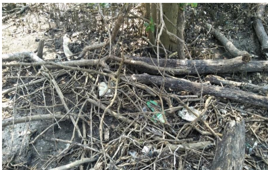
Figure 3. Branch damage broken stand of Avicennia marina .

Based on the above table, the carbon content is stored in CL2, which is dominated by the stands of Avicennia marina . Api-api (local name of Avicennia marina ) stands are dominant and have higher growth rates than the Bakau (local name of Rhizophora mucronata ) stands. However, the api-api stands suffered considerable damage due to broken branches (Figure 3). This contributes to the large amount of litter produced in the api-api stands.