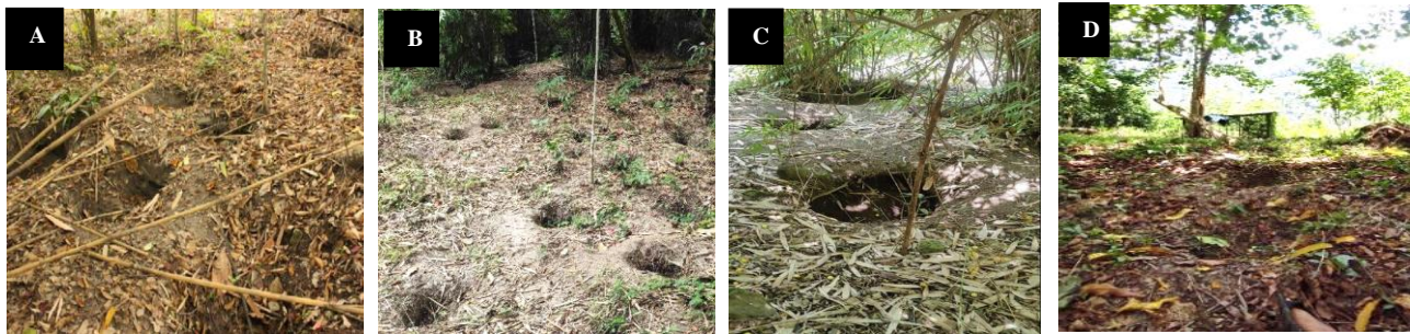
Figure 1 (A) Beringin nesting ground, (B) Halbolo nesting ground, (C) Alang-alang nesting ground, and (D) Pinanggobolu nesting ground