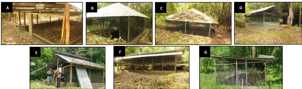
Figure 2 (A) Bamboo hatchery, (B) TN3 hatchery, (C) TN2 hatchery, (D) TN1 hatchery, (E) Fiper hatchery, (F) Florindus hatchery, (G) Emergency hatchery

The egg-hatching process in the hatchery was carried out semi-naturally using geothermal heat sources, and the burrows were created in soil with mixed texture. Hungayono has seven hatcheries located around the nesting sites, which have been managed since 2004 (Figure 2).