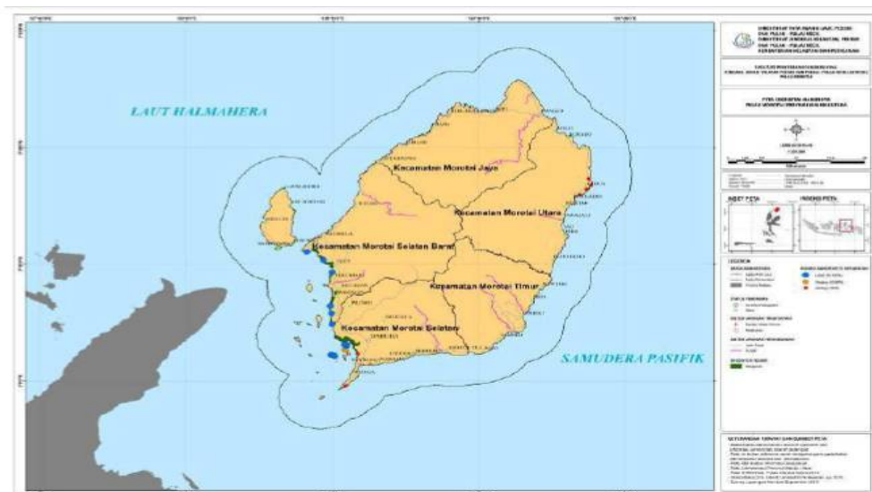
Figure 2 Mangrove ecosystem map on Morotai Island, Morotai Island Regency, North Maluku Province.