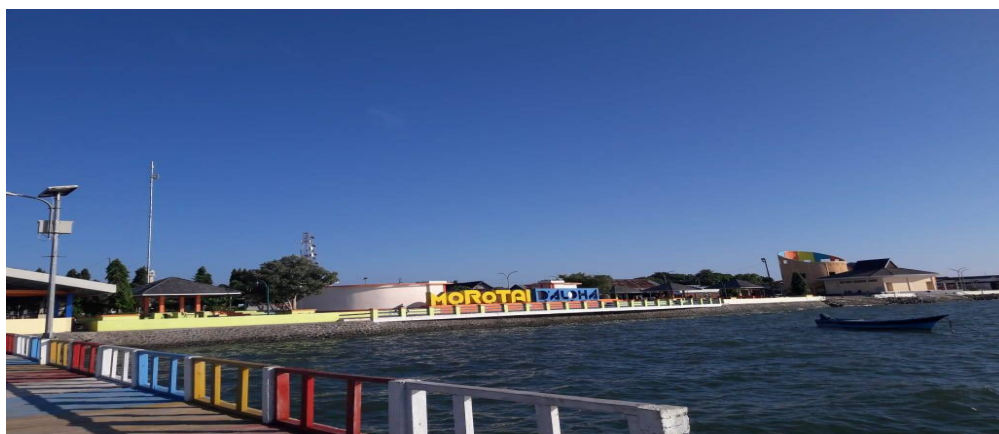
Figure 3 A photo of mangrove beach area that has been covered by landfill and will be developed into the construction of parks, culinary center buildings and hotels in Daruba City, the capital of Morotai Island Regency, seen from the sea towards the coast.