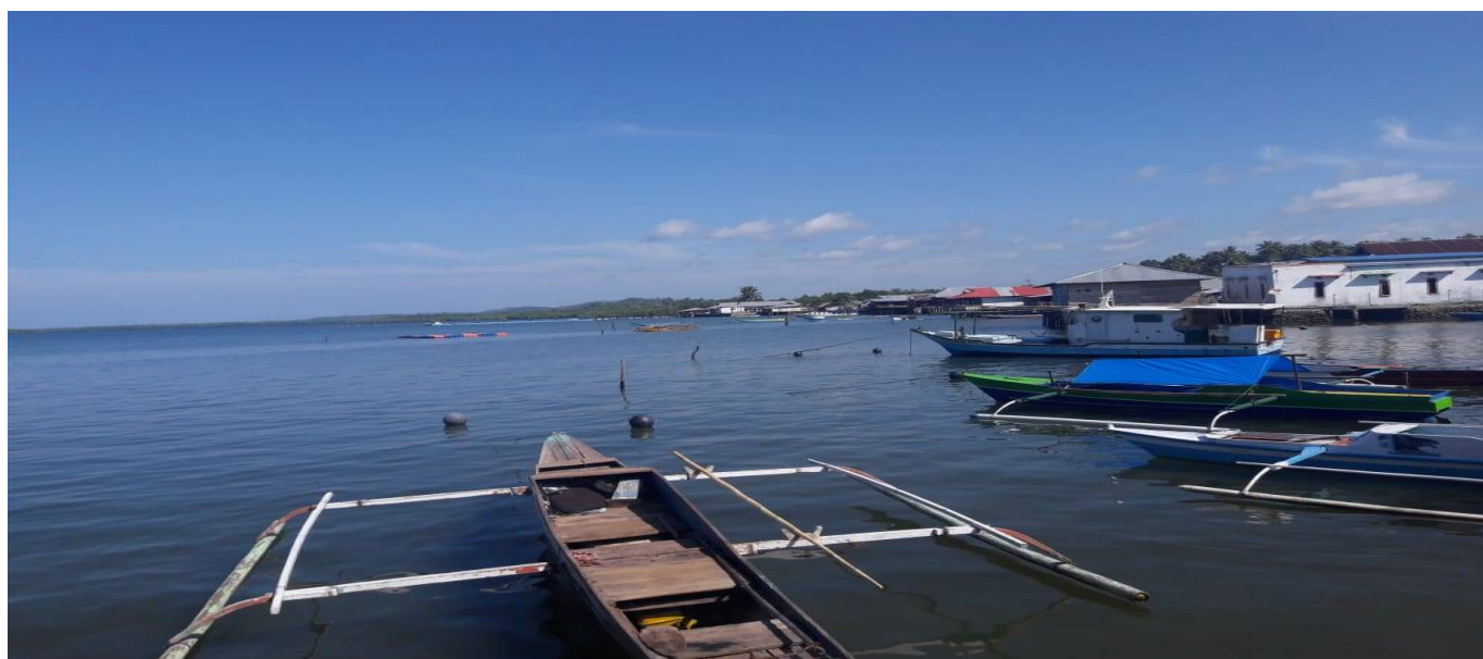
Figure 5 A photo of the remains of dried mangrove trees but can still be used by fishermen to tie their boats to the north side of the park, culinary center building, and hotels on the coast of Daruba City, the capital of Morotai Island Regency.