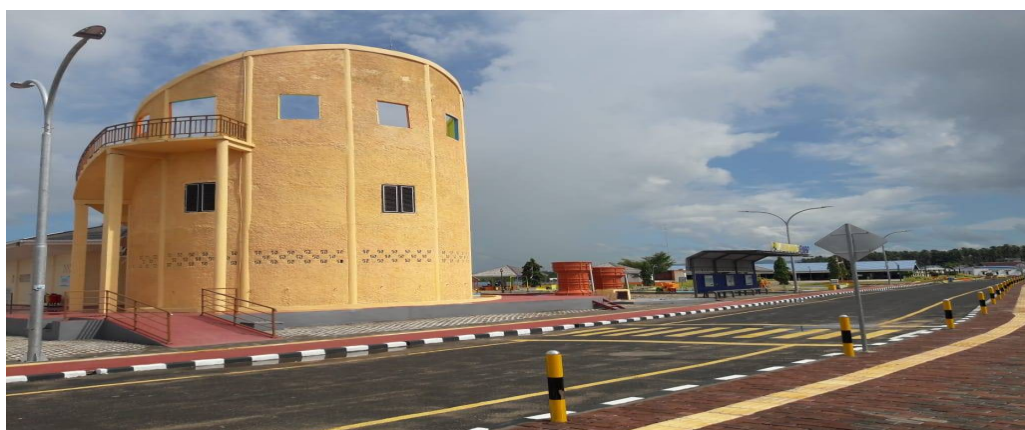
Figure 4 A photo of park, culinary center buildings and hotels on the coast of Daruba City, the capital of Morotai Island Regency, seen from the land to the beach.