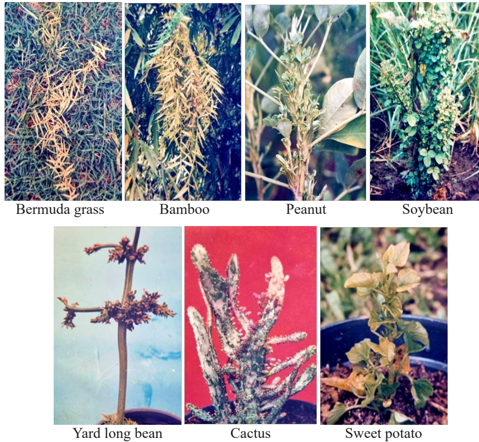
Figure 1 Symptoms of diseased plants from the field confirmed to be infected by phytoplasma through PCR method.