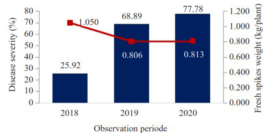
Figure 1 Severity of mottle disease and black pepper yield during three consecutive years 2018, 2019, and 2020.