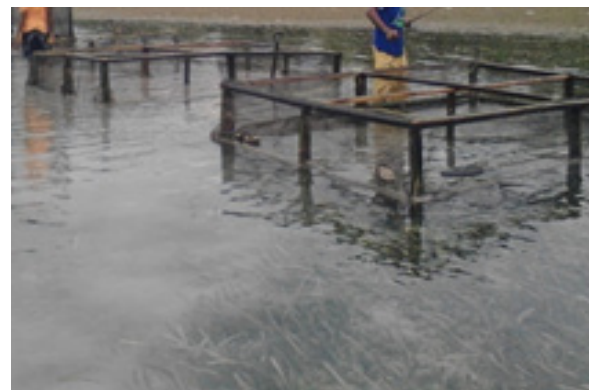
Figure 1. The construction of pen-culture for sea cucumber rearing (a = treatment A, b = treatment B)