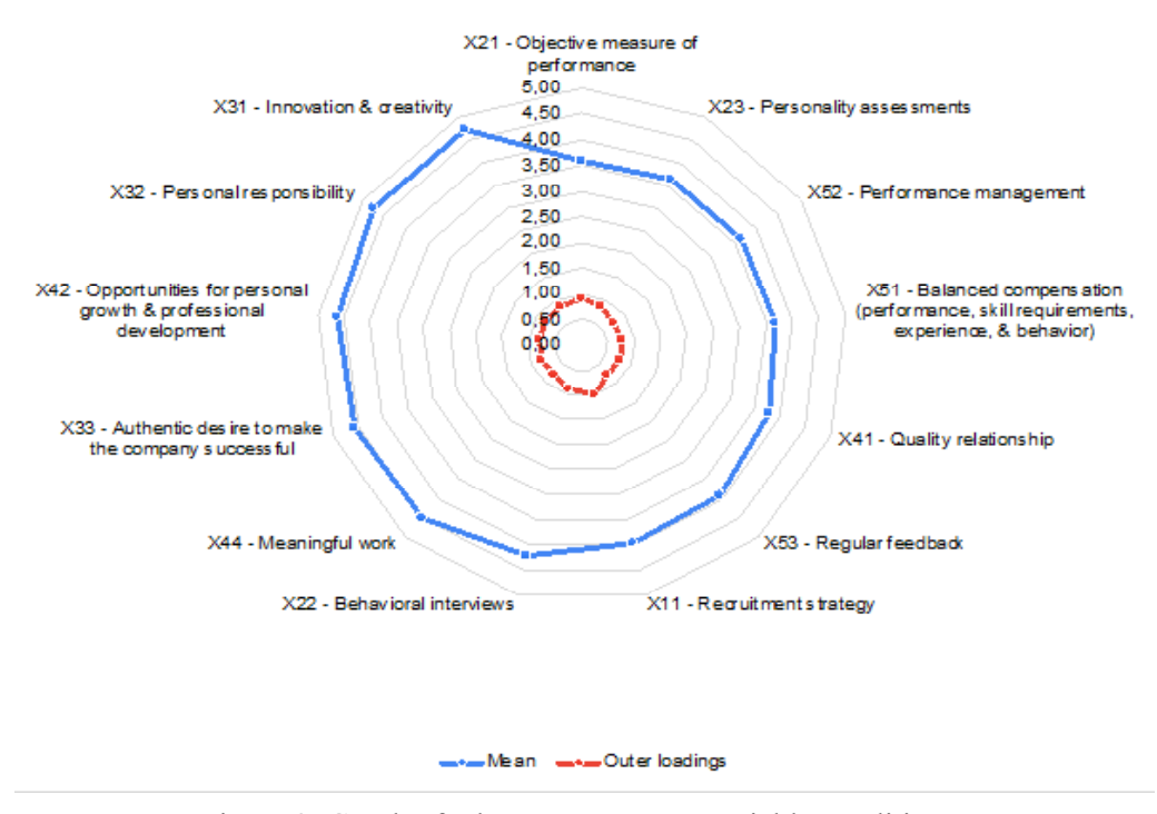
Figure 2. Graph of talent management variable conditions

From Figure 4 can show the corporate culture variables can be grouped in three indicators with the highest mean (close to value 5) and have a loading factor value > 0.5, namely discretion, dynamism, and flexibility which are categorized as adhocracy, where this type of culture is oriented to a very dynamic work environment, creative, innovative and risk-taking. This is in accordance with the environmental conditions of the internal corporate start-up program where this program encourages innovation, creativity and dynamic interaction, and is also supported by the composition of the majority of employees who are young.