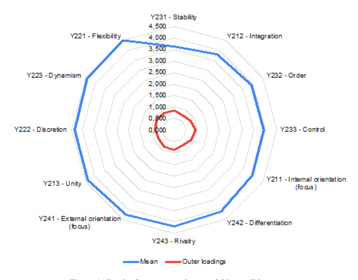
Figure 4. Graph of corporate culture variable conditions