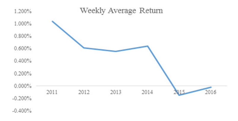
Figure 1. Property and real estate weekly average return

Investor requires information to guide their investment decision, both internal information such as financial statement and external information such as macro factors risk. According to Horne and Wachowich (1992), risk is defined as the variability between expected return and actual return. Without having the correct information, these variability will be greater than it should be.