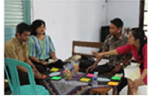
Figure 3. Implementation of select concept documentation

The sixth concept is persistent. This concept is the core of the other five concepts. All other five concepts (focus, connect, tweak, select, stealthstorm) have to be carried out synergistically. The five concepts are implemented based on the sixth concept. The proof of the participants' consistency are observed from several facts, they are, participants/entrepreneur still run the business even though there is no training, the entrepreneur look for relations with external parties (government, resellers, exhibition committee, etc). The participants are still persistent in finding creative ideas to increase business. The persistent of the participant are vulnerable especially when the resellers return their product (banana trunk chips). This is when the facilitators give encouragement even though it needs extra training duration.