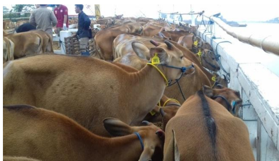
Figure 2. Female Bali's breed in traditional vessel.

IL-6. Examinations of neutrophil/lymphocyte ratio was obtained by comparing directly the percentage of neutrophil/lymphocyte.