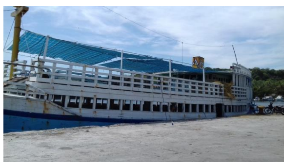
Figure 1. Traditional vessel "Setia Purnama".

Animals: Five female Bali's breed in 1-2 years selected by purposive sampling that transported from Sumbawa to Pontianak for 120 hours using 100 GT traditional vessel with two floors and a capacity of 300-400 heads (Figure 1 and 2).