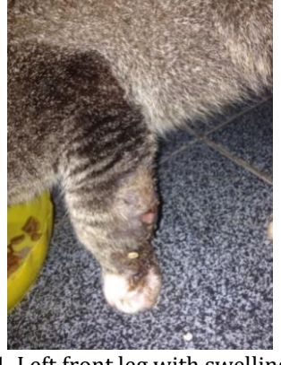
Figure 1. Left front leg with swelling