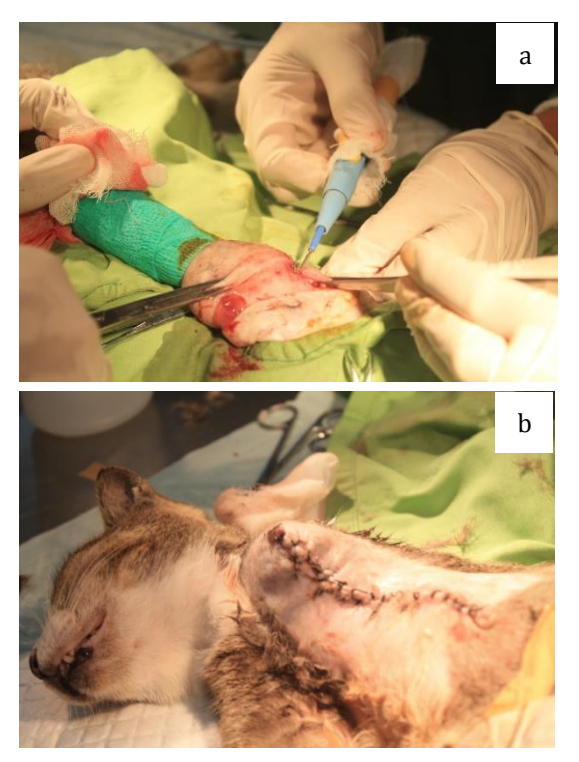
Figure 3. Surgery procedure (a), surgery result (b)

Skin incision started from 1/3 proximal part of os humerus down to medial part of the bone. After muscles were visible, they were incised surrounding os humerus by electrocautery tool with cutting blade while blood vessels were ligated. On lateral region, m.triceps brachii , т. brachiocephalicus, cephalica vein, and radialis nerve could be found. In medial region, m. biceps brachii, brachialis artery and vein, and ulnaris nerve could be found. Muscles that had been cut were then opened to reveal os scapularis and os humerus before then separated from each other. After no bleeding was confirmed, the tips of cut muscles were stitched together with simple stitches by using catgut 3/0 thread. Before stitching, liquid 50000 IU/mL penicillin was administered per topical. The skin was then stitched by silk 3/0 thread with horizontal mattress stitch combined with simple stitch method for strengthening purpose.