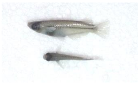
Figure 2. Sulawesi Medaka Fish ( Oryzias celebensis )

The histological picture of Sulawesi medaka is obtained by making histological preparations using standard histotechnical techniques. The following is a cross section of Sulawesi Medaka fish that shows the position of various Sulawesi Medaka fish organs (Figure 3.)