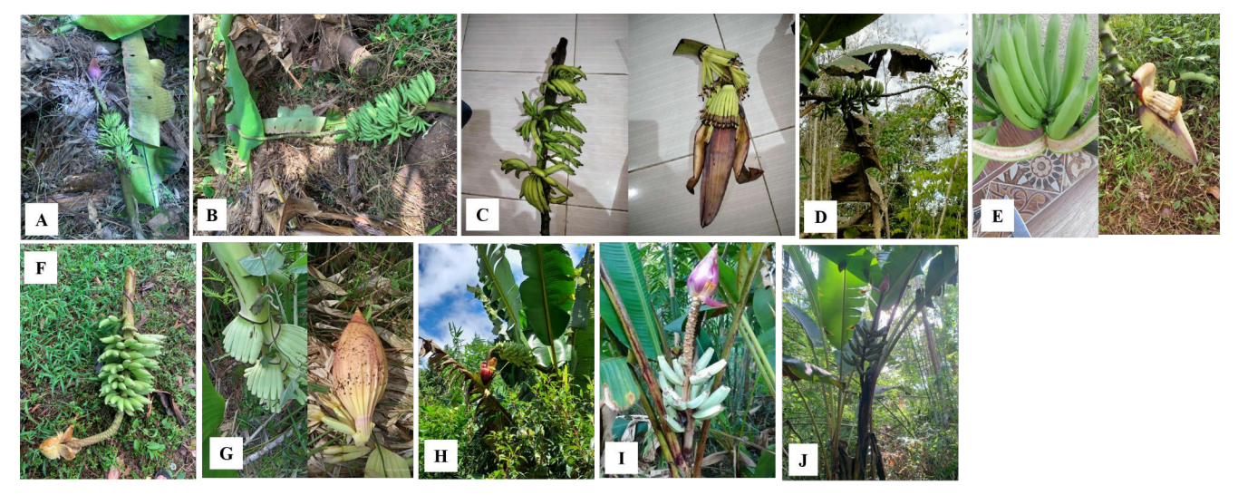
Figure 1. Morphological appearances of wild banana examined. (A) Musa acuminata subsp. microcarpa (Mempawah 1), (B) Musa acuminata subsp. microcarpa (Mempawah 2), (C) Musa acuminata subsp. microcarpa (Landak 1), (D) Musa acuminata subsp. microcarpa (Landak 2), (E) Musa acuminata (Ketapang), (F) Musa borneensis var. alatuceae (Kapuas Hulu), (G) Musa borneensis var. lutea (Kapus Hulu), (H) Musa borneensis var. phoenica (Melawi), (I) Musa campestris (Ketapang), (J) Musa campestris (Singkawang)

Geneaid. Amplification of rbcL gene sequences was conducted by PCR using rbcL forward primer (5'– ATG TCA CCA CAA ACA GAG ACT AAA GC–3') and rbcL reverse primer (5'– GTA AAA TCA AGT CCA CCR CG– 3') (Candramila et al. 2023). The PCR conditions consist of pre-denaturation at 95°C for 2 minutes, denaturation at 92°C for 1 minute, annealing at 50°C for 30 seconds, extension at 72°C for 1 minute, and post-extension at 72°C for 5 minutes. The denaturation, annealing, and DNA extension stages were repeated for up to 35 cycles. PCR products were performed by DNA electrophoresis process using 1% gel agarose. Sequencing of the rbcL gene was