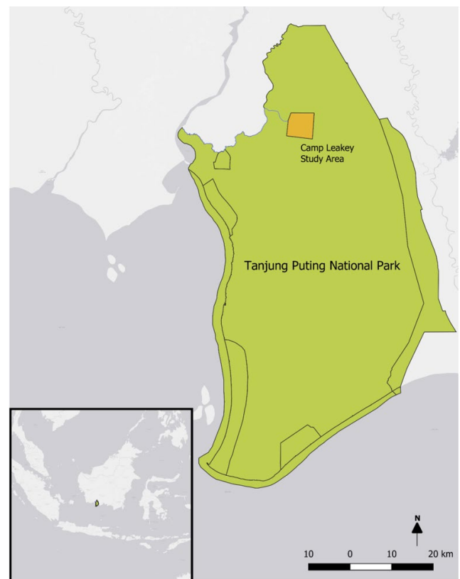
Figure 1. The Camp Leakey Study Area is located along the Sekonyer River in the northern portion of Tanjung Puting National Park in Central Kalimantan, Indonesian Borneo, Indonesia

With an area of approximately 4,150 km 2 (1,886 km 2 of orangutan habitat), Tanjung Puting National Park (Figure 1) is one of the largest protected areas in Central Kalimantan (Utami-Atmoko et al. , 2017). The Camp Leakey study area was initially established within a 35 km 2 area and contains a mix of dry ground