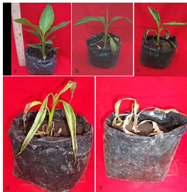
Figure 2. Phenotypes of abaca plants with various degrees of wilting symptoms at 60 days after inoculation with F. oxysporum f.sp. cubense . a. Score 0, b. Score 1, c. Score 2, d. Score 3, and e. Score 4, based on criteria developed by Epp (1987).

n_i : number of abaca plants with i^{\text{th}} score of symptoms, s_i : the value of the i^{\text{th}} score of symptoms, N : total number of tested abaca plants, and S : the highest value of score of symptoms (Cachinero et al. 2002).