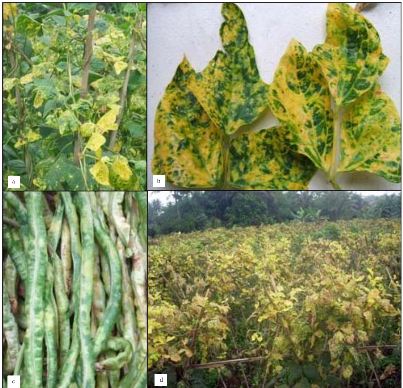
Figure 1. Symptoms of yellow mosaic disease in yard long beans. Trifoliate leaves of infected plants showed severe yellow mosaic symptoms (a and b), the pods produced by infected plants showed deformations and mosaic (c), and severe infection in the field (d).

tested with ELISA using antisera (AS-0929) raised against Cucumber mosaic virus (CMV; genus Cucumovirus ).