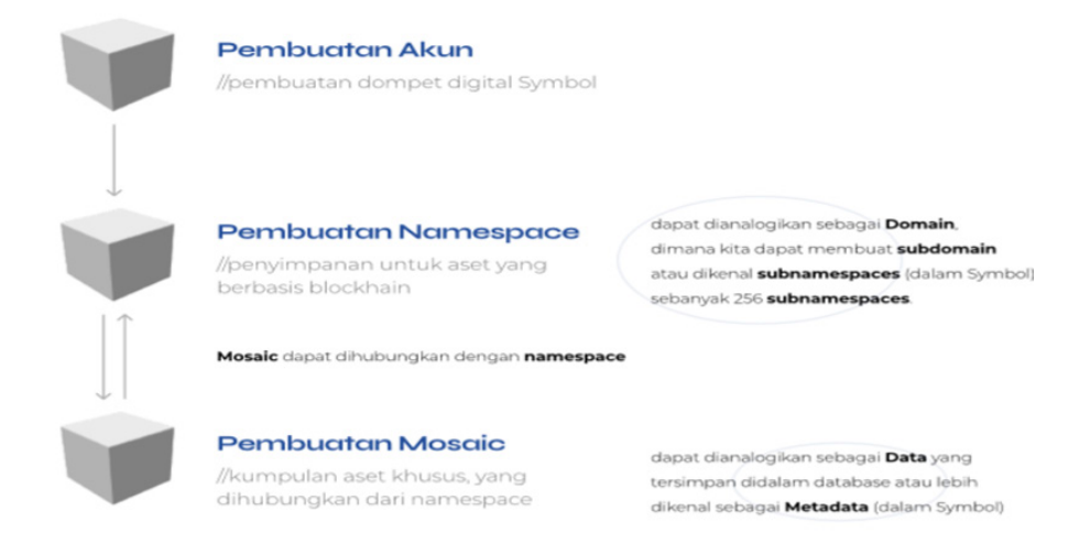
Figure 1. Data transaction

Blockchain technology functions like a ledger that records all transaction data in a distributed or peer to peer (P2P) system. If data is created by one peer, then other peers will replicate it. Changes in data, whether in the form of sales transactions or inheritance, are monitored in the blockchain system whose data cannot be changed and is irreversible. To create this blockchain-based land system, manual land certificate documents need to be converted first into digital code (digitized) that is compatible or in accordance with the blockchain architecture. This process is usually referred to as creating a Blockchain Compatible Platform (BCP) (Soner et al. 2021). Blockchain data transactions take place on the Symbol protocol, as shown in Figure 1.