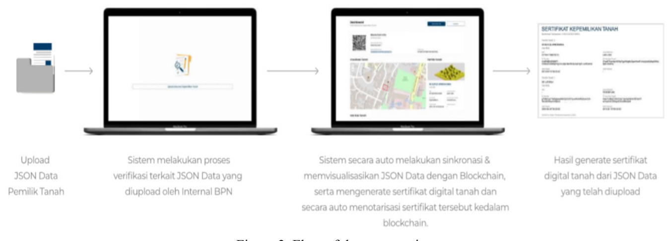
Figure 3. Flow of data transaction