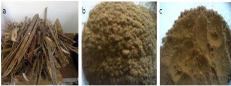
Figure 1 Stages milling rattan bark fiber long fiber (a), particles <75 \mu\text{m} (b), and nanoparticles (c)