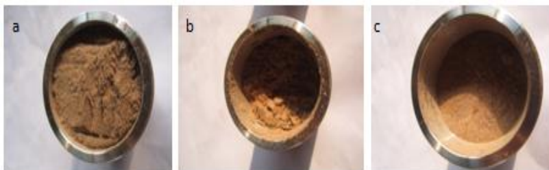
Figure 2 High Energy Milling Process rattan bark fibers fiber filled vial and balls (a), after the milling process (fibers shrink) (b), fiber and milling yield (c)