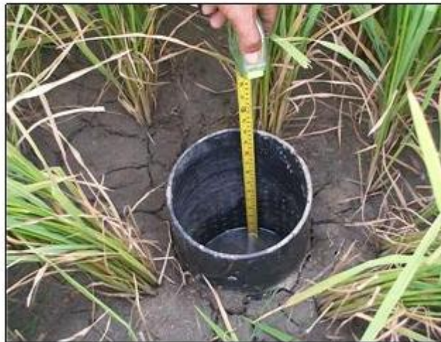
Figure 3 Field water tube to determine time to irrigate in the AWD irrigation method