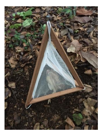
Figure 1 Traps

Quail cadavers were each placed in a pyramid trap measuring 30x30x40 cm at 06.00 WIB (Figure 1). Each side of the trap is walled with gauze, which allows the smell of quail cadaver to be detected by decomposer insects. The bottom of the trap is given a gap about 1 cm high so that decomposer insects can enter the trap.