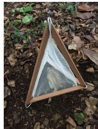
Figure 1 Traps

Quail cadavers were each placed in a pyramid trap measuring 30x30x40 cm at 06.00 WIB (Figure 1). Each side of the trap is walled with gauze, which allows the smell of quail cadaver to be detected by decomposer insects. The bottom of the trap is given a gap about 1 cm high so that decomposer insects can enter the trap.