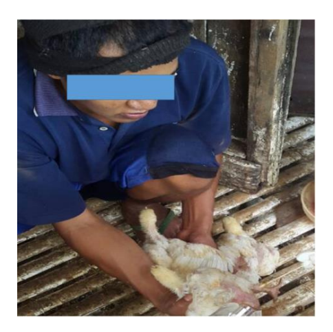
Figure 2 Flockworkers do not use proper PPE

Results of Likelihood Exposure Assessment of Colistin-resistant Escherichia coli to Humans in Broiler Flocks