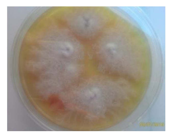
Figure 3 Sabouraud dextrose agar showed a flat colony, white to cream in colour, with powdery to granular surface

In this case, combination of systemic and topical treatment were used on the basis of mycological analysis results and the clinical signs. A systemic oral therapy with itraconazole at a dose of 10 mg/kg, and topical treatment with ketoconazole twice a day. Borgers et al. (1993) suggested that topical therapy alone does not adequately penetrate the hair follicle and that optimal treatment of dermatophytosis caused by species that invade the hair follicle and