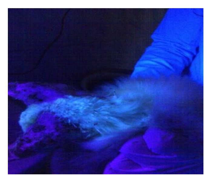
Figure 2 Green fluorescent on the head and ears

Figure 1 A patches of scalp hair loss, scaling, scratching, crusting, and alopecia on the ears