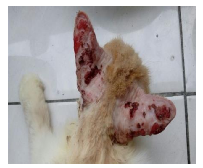
Figure 1 A patches of scalp hair loss, scaling, scratching, crusting, and alopecia on the ears