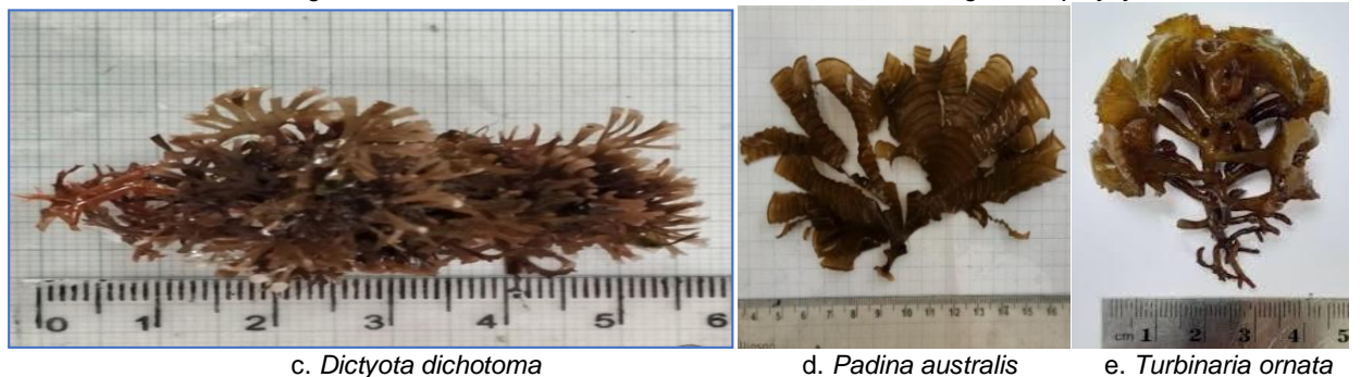
d. Padina australis