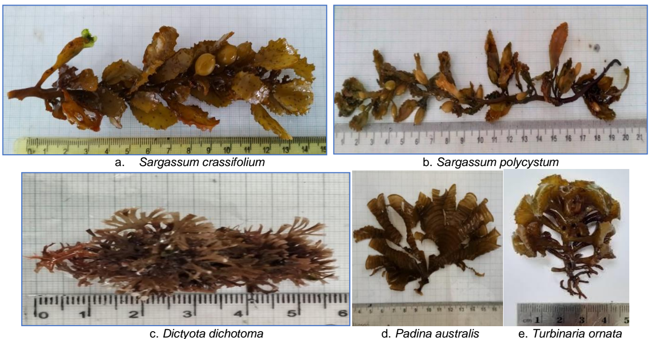
Figure 2 Species of brown macroalgae from Pedalen Beach, Kebumen.

Phaeophyta species that grow on hard coral substrates are more numerous than those that live on a mixed substrate of coral rubble and sand substrates. The highest average biomass is from S. polycystum (1,630 g.m -2 ), and the lowest is from Dictyota dichotoma (8 g) (Table 1). The coral substrate is a hard