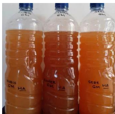
Figure 2 Appearance of the ecoinzyme after filtration, showing brown to dark brown coloration.

mortality. Mursyid et al. (2022) obtained similar results, demonstrating that both lactic and acetic acids can cause mite mortality. Islami (2022) also discovered that ecoenzymes derived from Citrus hystrix had acetic acid concentrations ranging from 3.32 to 5.53%. Acetic acid is renowned for its corrosive qualities, which destroy insect cuticle structures and eventually lead to death (Hastuti et al. 2019). Lactic acid, at high quantities, can also impair larval development and cause death (He et al. 2021). In addition to organic acids, ecoenzymes