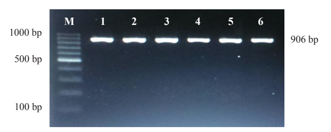
Figure 1. The band pattern visualization of PCR products of Cyt b gene of local swamp buffaloes in 1.5% agarose electrophoresis. M= marker, number 1-6= samples of PCR product.

Variable sites consisted of 3 (0.35%) parsimony sites-informative and 6 (0.69%) singleton sites. A site is parsimony-informative if it contains at least two types of nucleotides, and at least two of them occur with a minimum frequency of two; meanwhile a singleton site contains at least two types of nucleotides with, at most, one occurring multiple times (Tamura et al. , 2013). The highest parsimony site was found 3 sites (0.35%) in