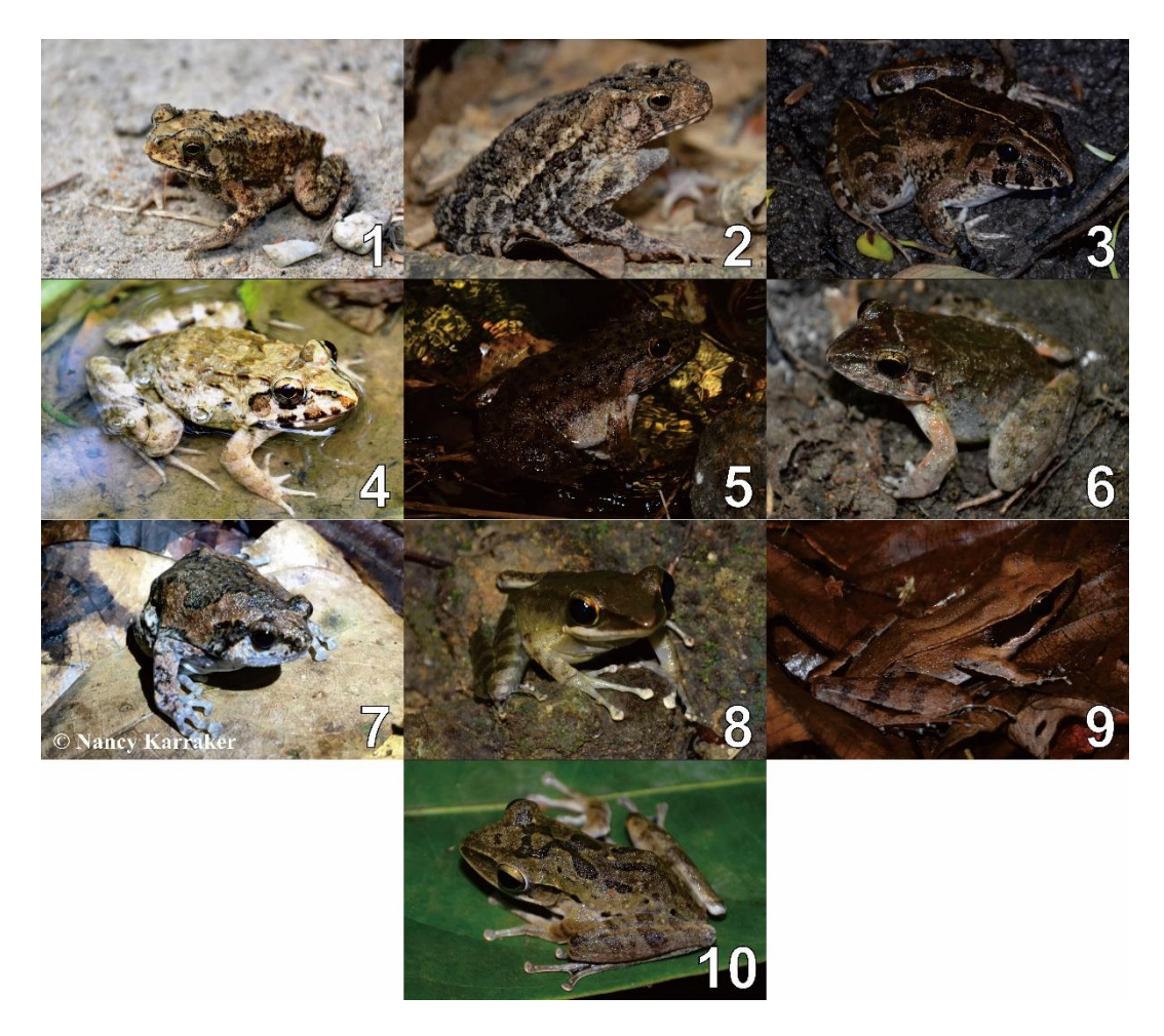
Figure 2 List of Amphibians. (1) Duttaphrynus melanostictus. (2) Ingerophrynus biporcatus. (3) Fejervarya cancrivora. (4) Fejervarya limnocharis. (5) Limnonectes grunniens. (6) Limnonectes modestus. (7) Kaloula baleata. (8) Chalcorana mocquardi. (9) Papurana celebensis. (10) Polypedates iskandari.

Table 3 Number of species, abundance, diversity, evenness and estimated species richness of amphibian and reptiles in four different type of habitat in Rawa Aopa Watumohai National Park.