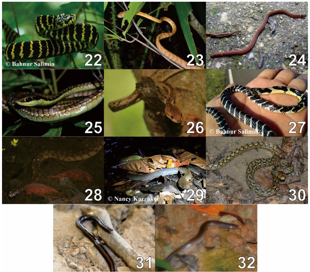
Figure 3 List of Reptiles. (1) <u>Draco beccarii</u>. (2) Hydrosaurus celebensis. (3) <u>Cyrtodactylus jellesmae</u>. (4) <u>Gehyra mutilata</u>. (5) <u>Gekko gecko</u>. (6) <u>Hemidactylus frenatus</u>. (7) <u>Hemidactylus platyurus</u>. (8) <u>Emoia atrocostata</u>. (9) <u>Emoia caeruleocauda</u>. (10) <u>Eutropis indeprensa</u>. (11) <u>Eutropis macrophthalma</u>. (12) <u>Eutropis multifasciata</u>. (13) <u>Eutropis rudis</u>. (14) <u>Lamprolepis smaragdina</u>. (15) <u>Sphenomorphus variegatus</u>. (16) <u>Sphenomorphus sp. 1</u>. (17) <u>Sphenomorphus sp. 2</u>. (18) <u>Cuora amboinensis</u>. (19) <u>Varanus salvator</u>. (20) <u>Crocodylus porosus</u>. (21) <u>Ahaetulla prasina</u>. (22) <u>Boiga dendrophila gemmicincta</u>. (23) <u>Boiga irregularis</u>. (24) <u>Calamaria nuchalis</u>. (25) <u>Dendrelaphis pictus</u>. (26) <u>Psammodynastes pulverulentus</u>. (27) <u>Ophiophagus hannah</u>. (28) <u>Cerberus schneiderii</u>. (29) <u>Hypsiscopus matannensis</u>. (30) <u>Malayopython reticulatus</u>. (31) <u>Virgotyphlops braminus</u>. (32) <u>Xenopeltis unicolor</u>.