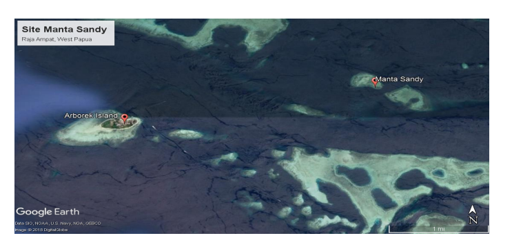
And a state

Data collection was conducted in Manta Sandy, Raja Ampat. Raja Ampat is located in Eastern Indonesia. Raja Ampat regency is one of the districts in West Papua, Indonesia. The capital of this district is located in Waisai. Raja Ampat islands consist of 4 islands, Misool, Salawati, Batanta dan Waigeo. Manta Sandy is located in the Dampier Strait. Manta Sandy is a popular tourist site for manta rays watching tourism in Raja Ampat (Hani, 2018).