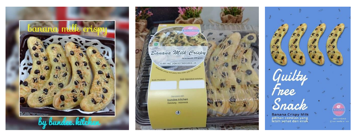
Figure 4. Bundee Kitchen Product Promotion Flyer Design Before and After Mentoring