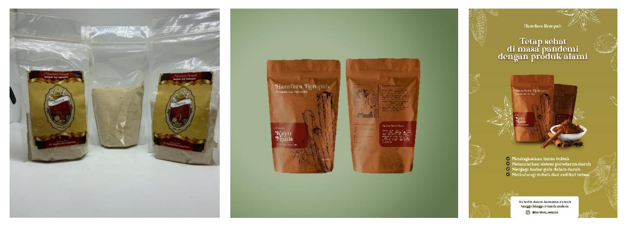
Figure 5. Hamfara Spice Packaging Design Before and After Mentoring