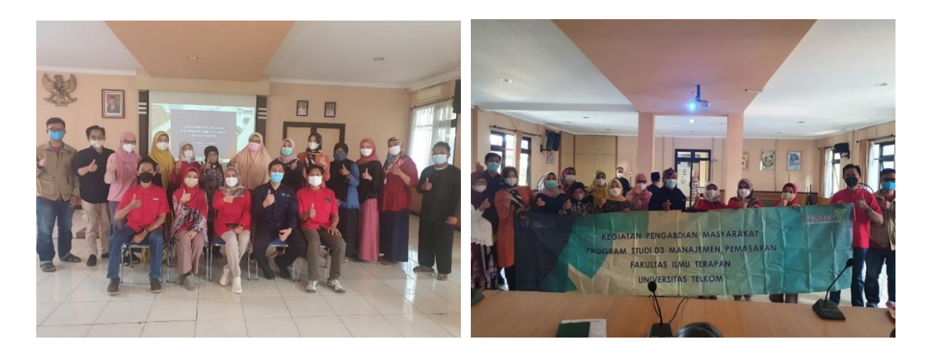
Figure 3. Implementation of Online Marketing Education Workshop for MSMEs

MSMEs were offered online marketing strategy and promotion aid as well as package design support and website administration assistance in this service activity, which was aimed at helping MSMEs. For the purpose of enhancing the competitiveness of high-quality goods in Buah Batu District, an online marketing education session was held (the effidence can be show in Figure 3). Workshop participants learned about internet marketing tactics for Buahbatu District-based MSME players, which might help them improve their goods' competitiveness and increase market share. It is possible for target partners to make items that can compete with other products and hence have a better selling value, as well as to create digital promotional media like social media profiles and marketplaces for MSMEs. The program also included a product design session (packaging and labeling). As the quality of product design and packaging improves, MSMEs in Buah Batu District are able to compete with rival items because their packaging is more appealing and meets industrial packaging requirements.