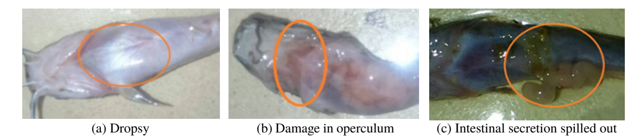
Figure 2. Clinical symptoms after infection at fifth day with Aeromonas hydrophila

body was activated the immune response through producing the polymorphonuclear leukocytes (melanophages, monocytes, and neutrophil) as phagocytic cells. Leukocytes triggered the bacteria to issue a hemolysin toxin that causing ulcer and hemorrhage in the surface of the fish body (Mangunwardoyo et al. , 2010).