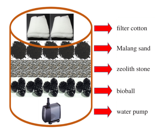
Figure 2. Filtering drum composition.